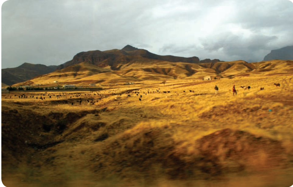
Alamut, around 100 km from present-day Tehran - Qazvin Province -Iran