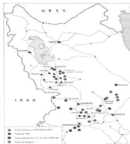
Figure 3. A map showing the natural plague foci in northwestern Iran, including Azarbaijan, Kurdistan, Kermanshah, and Hamadan provinces based on four different studies 22