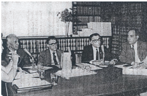
Figure 6. A picture of the International Seminar of the Human Plague, Pasteur Institute of Iran, 1970.

The Bacteriology Department of the Pasteur Institute of Iran was established in 1953 23 and was a pioneer in research on epidemic diseases, including the human plague. An international plague seminar was held at the Pasteur Institute of Iran in 1970 (Figure 6). 20