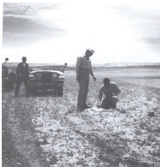
Figure 2. The investigative team of the Pasteur Institute of Iran evaluating plague bacilli infected reservoirs among the rodents in Kurdistan Province, Iran 22