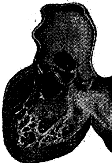
Fig. 3.—Amplified sketch of malformation seen in Fig. 2.

Histological Examination. —The alveoli in some parts of the lungs are filled with blood; also the bronchi; the lining epithelium normal. Spleen, adrenals, kidneys, thyroid, and liver greatly congested; most of the alveoli of the thyroid are empty; in some is a pinkish material (hematoxylin and eosin stain). Sections of the mitral valve show no inflammatory changes.